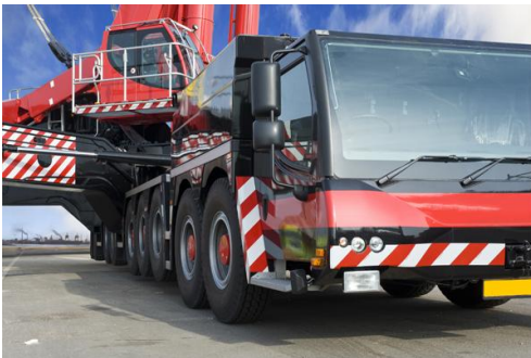
Figure 7. Mobile Cranes

May be used to provide wheel angle on the mechanically-linked axes to help ensure equal tire wear, extending expensive tire life and saving replacement costs. Information may also be used to provide optimized, restriction-free wheel turning, especially in muddy construction sites, helping to prevent stuck equipment. The non-contact technology on this equipment provided by this sensor is preferred by equipment renters.