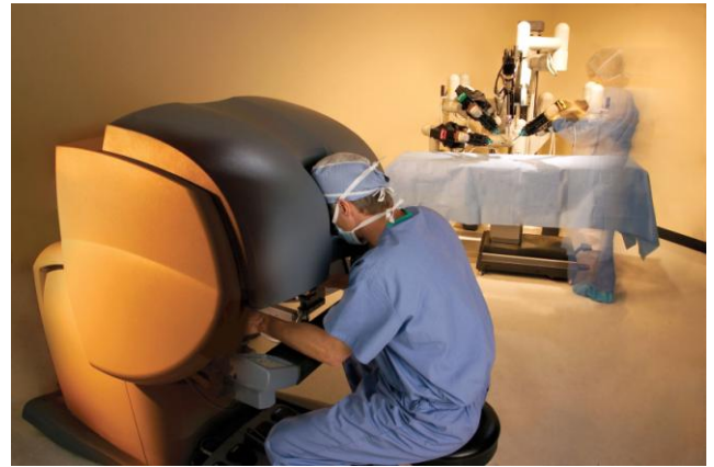
Figure 19. Robotically-Assisted Surgery Equipment

May be used to provide position of the robotic arms that hold the articulated instrument tips, allowing the precise control that enables revolutionary minimally invasive surgical procedures.