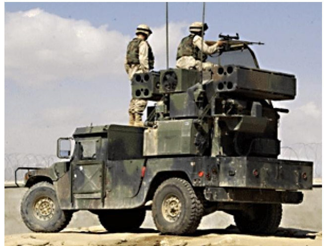
Figure 15. Chassis Suspension Systems

May be used to provide weapon elevation for a variety of targeting functions (i.e., 180° gun turret positioning, no-fire above a specified elevation) that may be controlled through a remote joy stick, helping to ensure firing accuracy.