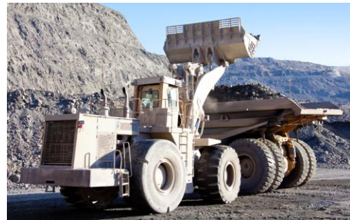
Figure 9. On-board Loader Weighing Systems

May be used to provide loader bucket angle in order to help determine on-the-spot content weight which eliminates wasteful and time-consuming dumping onto a separate weighing site before loading into the truck bed, helping to prevent overloads, and saving fuel and labor costs.