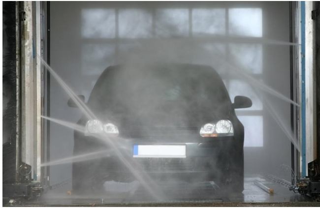
Figure 11. Automated Touchless Vehicle Wash Systems

May be used to provide position of the water spray arm that runs the length of the vehicle during the wash cycle, allowing the system to know when the arm has reached the end of the vehicle. This durable, IP67-sealed sensor replaces the proximity sensors that are currently used in this harsh environment, providing greater reliability and longer product life.