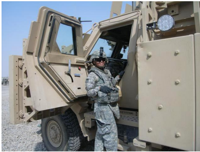
Figure 16. Military Vehicle Door Position