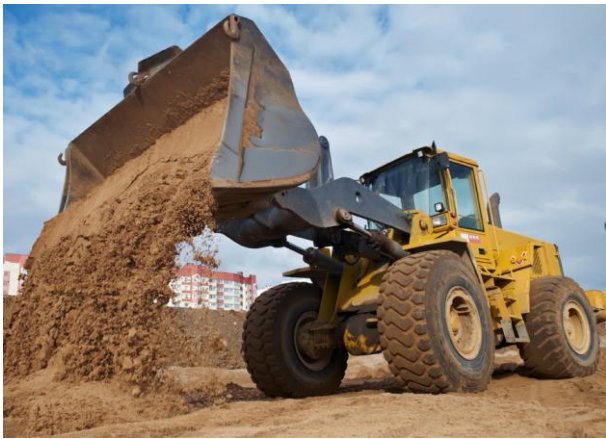
Figure 3. Front End Loaders

May be used to automate repetitive motion sequences, such as dig-dump-dig, which then require only a single hit of a joy stick to repeat, improving efficiency and reducing operator stress. May also be used to provide bucket height position restriction which helps to avoid overhead power lines or other obstacles in the area (envelope control), enhancing operator safety.