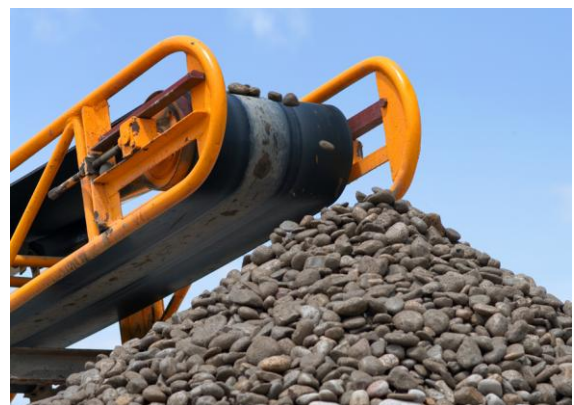
Figure 10. Telescoping Conveyor Systems

May be used to provide conveyor elevation which helps to ensure the conveyor is at the optimal height to provide the correct mix of falling material containing uneven particles (i.e., dirt, gravel, ore) as it is processed off the conveyor into piles. This sensor's durable and reliable non-contacting technology increases product life in these harsh environments.