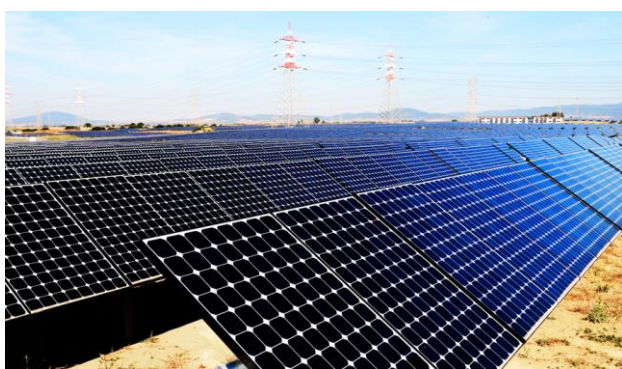
Figure 17. Ground-Based Solar Panels

May be used to provide elevation and azimuth, enhancing control and operation.