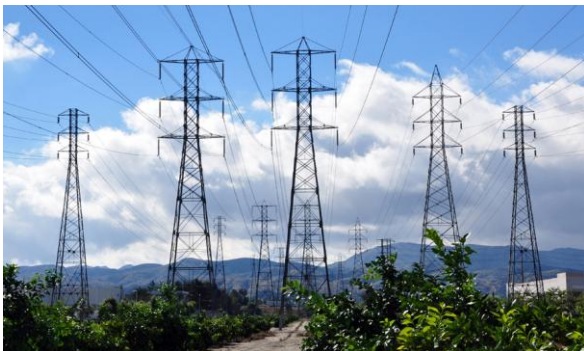
Figure 12. Power Generation

May be used to provide switching contact angle, ensuring contact has moved to the correct position through its 0° to 90° range. Information may also be used to determine contact speed, helping to identify slower contacts that may be wearing out, preventing possible catastrophic power failures.