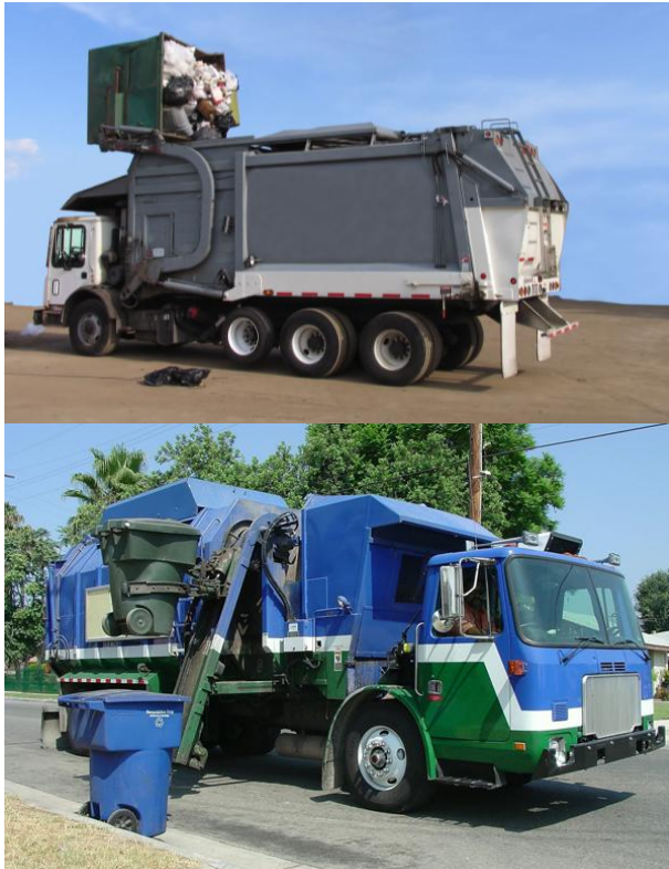
Figure 6. Refuse Trucks

May be used to monitor the angle of a truck's twin dumpster lifting arms. May also be used to provide position to the operator inside the cab who uses a joystick to manipulate automated reach arms to accurately pick up and empty smaller trash cans. One sensor can replace at least three proximity sensors, providing absolute position versus approximate position. The sensor's non-contact technology increases product reliability and life in these dirty, tough environments.