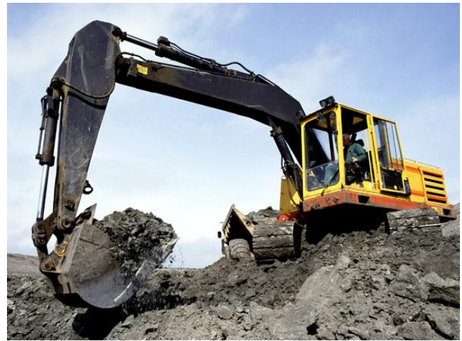
Figure 4. Diggers/Excavators

May be used to provide digging arm position in order to provide real-time survey information along with the GPS (Global Positioning System) mounted on the digging equipment. A SMART Position Sensor Arc Configuration sensor is mounted on the digging arm. This position information is sent to an electronic control unit which uses this input, along with the location input from the GPS, to provide data on the equipment position and location, as well as hole width and depth, eliminating surveyor costs. The control unit can also calculate and convey cab/digger alignment to the operator in the cab, eliminating the need for the operator to twist his/her head to see the digger, especially in uneven environments, enhancing operator safety.