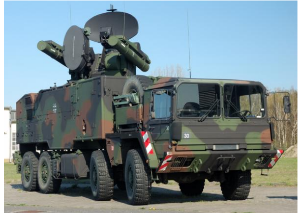
Figure 14. Remote Weapon Systems

May be used to provide weapon elevation for a variety of targeting functions (i.e., 180° gun turret positioning, no-fire above a specified elevation) that may be controlled through a remote joy stick, helping to ensure firing accuracy.