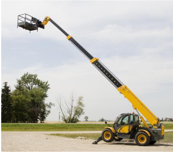
Figure 2. Aerial Work Lift Platforms

May be used to provide boom angle position which helps to prevent tipping on inclines and keeps the equipment within a safe extension range (envelope control), enhancing operator and bystander safety.