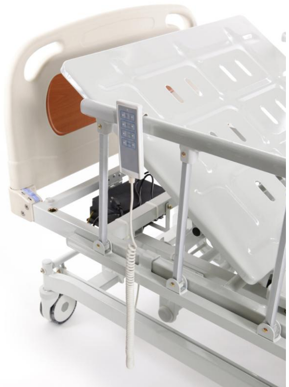
Figure 20. Patient Bed Elevation

May be used to monitor backrest elevation which helps to ensure proper angle, as well as automatic notification in the event the elevation exceeds or falls below a set value, helping to ensure optimal backrest position as prescribed by individual patient's medical condition.