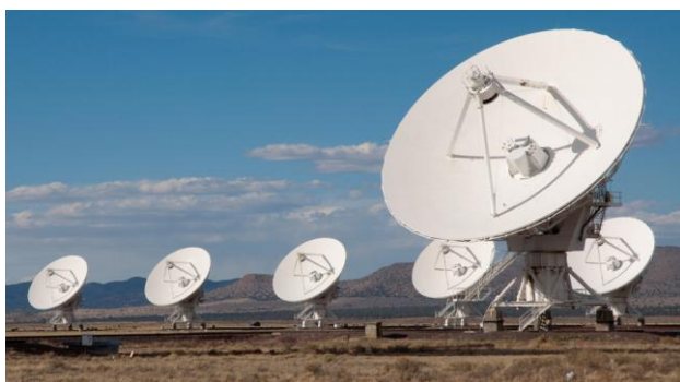
Figure 18. Ground-Based Satellite Dishes

May be used to provide elevation and azimuth, enhancing control and operation.