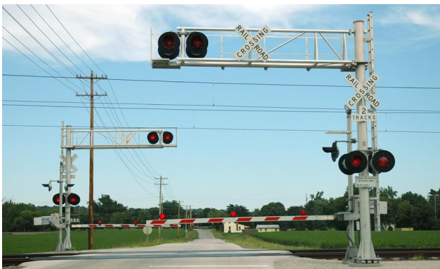
Figure 13. Rail-Road Crossing Arms

May be used to provide crossing arm position, enhancing traffic safety. This sensor's non-contact technology increases reliability and product life in this harsh environment.