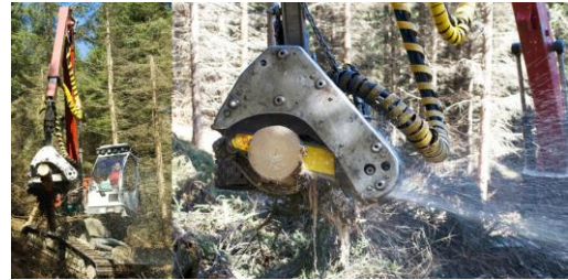
Figure 8. Timber Harvester/Processor Equipment

May be used to provide continuous cutter arm angle to the on-board computer as the equipment processes the decreasing tree length, allowing the tree diameter and lumber volume to be immediately determined. Information also helps to ensure the floating cab is aligned with the cutter head, eliminating the need for the operator to twist his/her head, improving efficiency, enhancing operator safety and reducing operator stress.